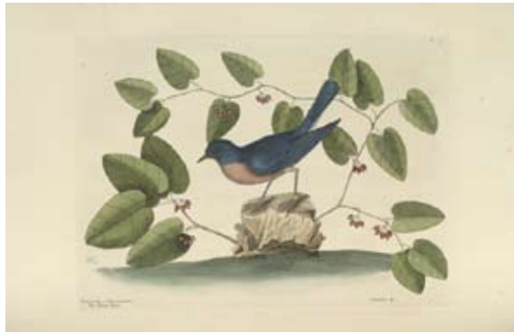
PLATE 47: The Blue Bird and the Smilax