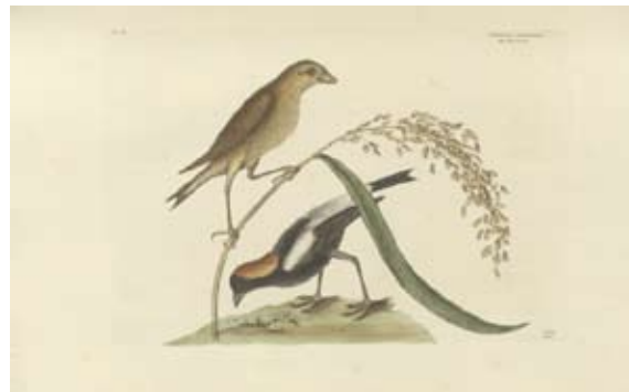
PLATE 14: The Rice Bird