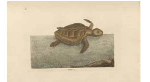
PLATE 140: The Loggerhead Turtle Front page PLATE 76: The Blew Heron

All Catesby prints measure 14 x 11 inches Price: $45 each/ portfolio of eight $295 Titles shown are Catesby's own.