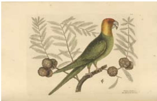
PLATE 11: The Parrot of Carolina [extinct]

☞ Look out for the Catesby documentary film The Curious Mr Catesby soon to be broadcast: www.catesbytrust.com .