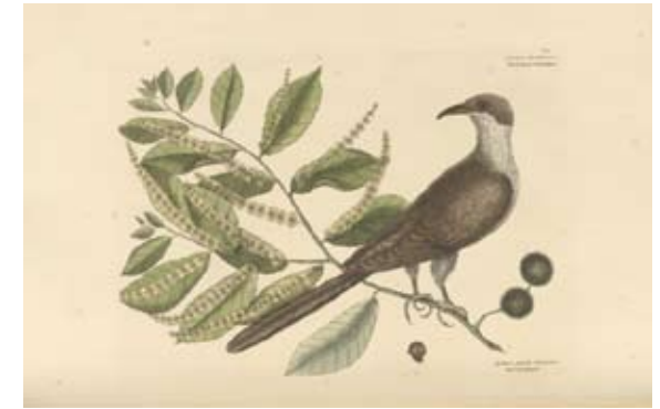
PLATE 9: The Cuckoo of Carolina