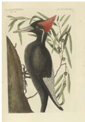
PLATE 16: The Largest White-billed Woodpecker