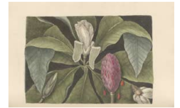
PLATE 180: The Umbrella Tree